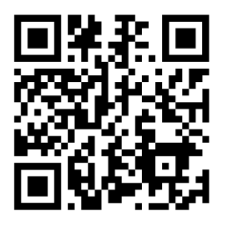
Scan Me for More Information